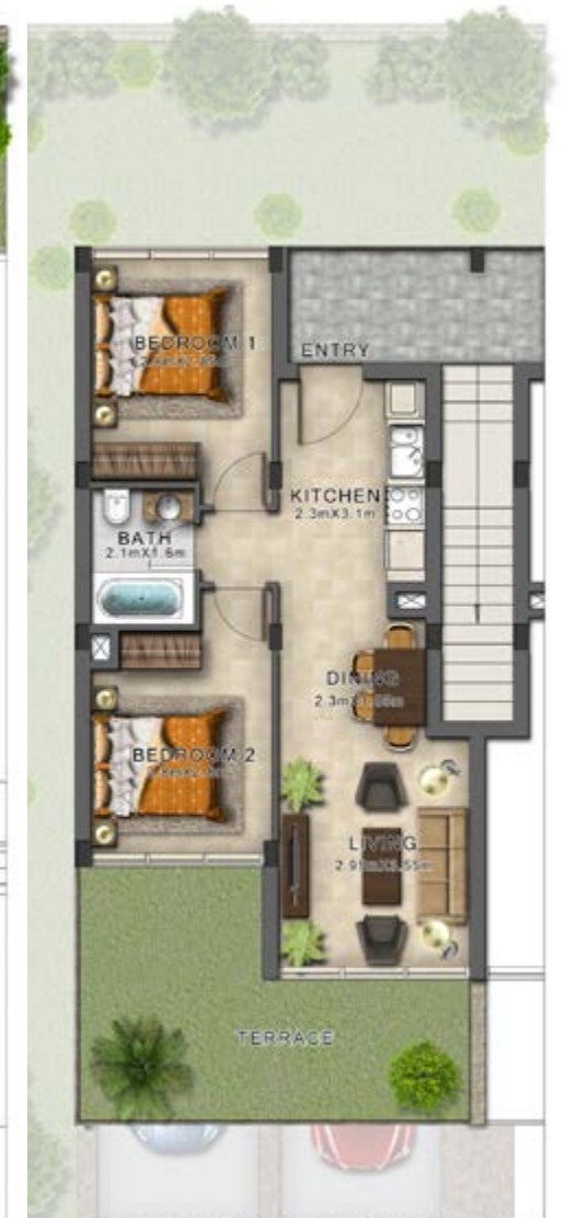
TH2F-EM / First Floor

Disclaimer: Unless stated above, all accessories and interior finishes such as wallpaper, chandeliers, furniture, electronics, white goods, curtains, hard and soft landscaping, pavements, features, swimming pool(s) and other elements displayed in the brochure, or within the show apartment / villa or between the plot boundary and the unit, are not part of the standard unit and exhibited for illustrative purposes only. Areas shown are based on plans at the time of printing; actual dimensions could vary up to final 'as built' status and are not intended to form part of any contract or warranty.