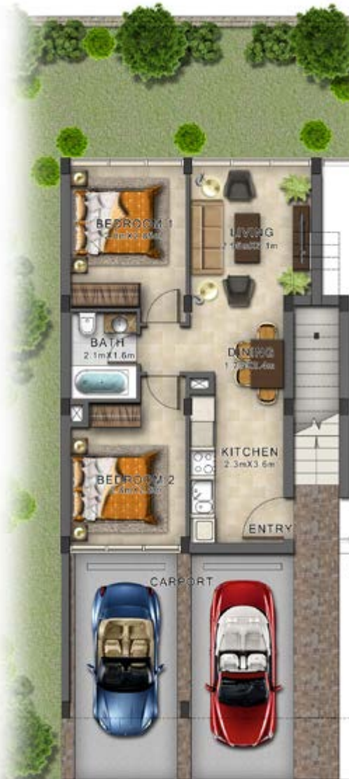
TH2G-EE / Ground