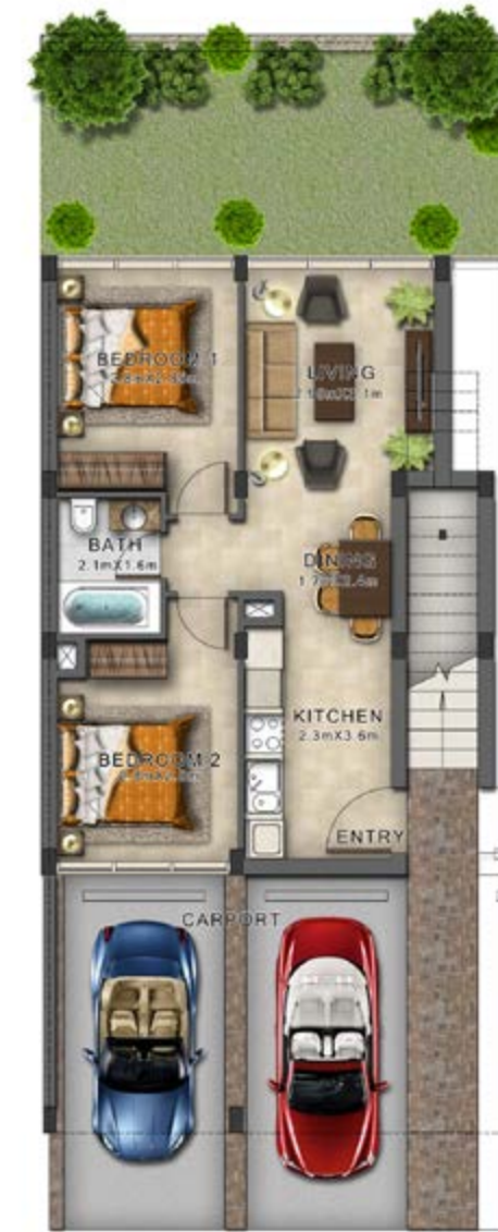
TH2G-MU / Ground

2 BEDROOMS + LIVING ROOM + KITCHEN + PRIVATE GARDEN OR TERRACE + COVERED PARKING