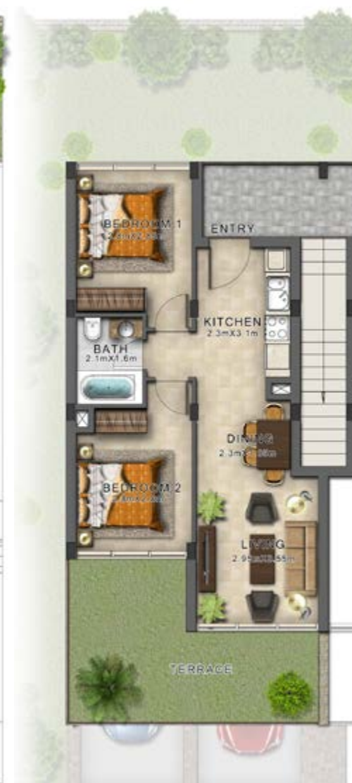
TH2F-EE / First Floor