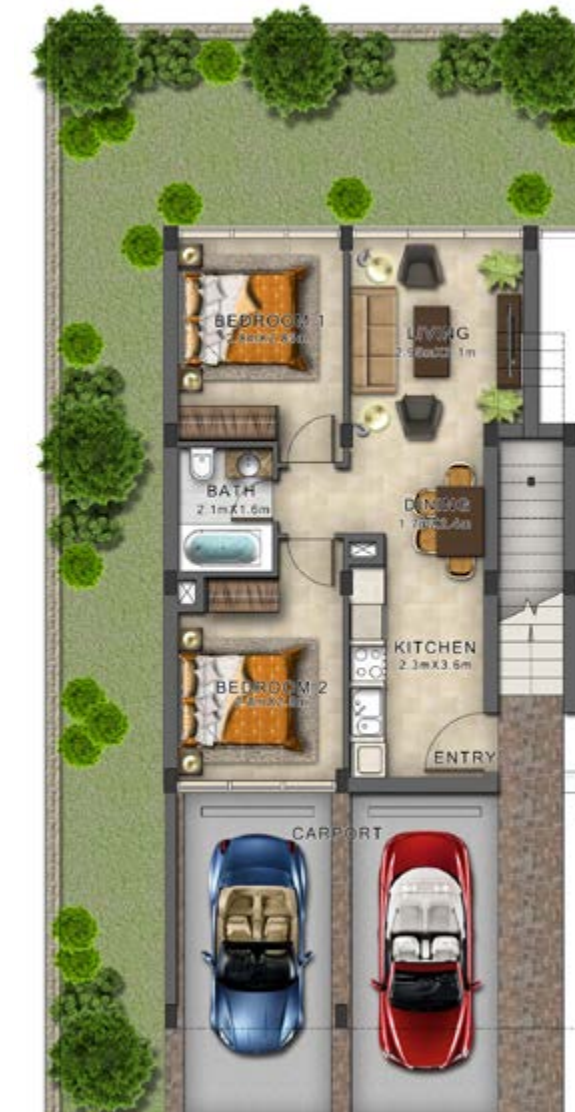
TH2G-EM / Ground