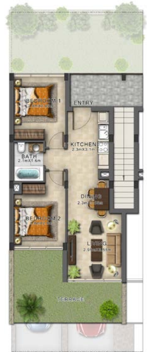
TH2F-MU / First Floor